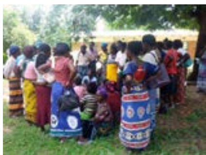
Women in a discussion group during the self-facilitated Vision Workshop Process.

We are supporting this community by supporting and funding the establishment of a community bank (a savings and credit cooperative- SACCO). Through the SACCO, Empower will support development of agricultural cooperatives and renewable energy financing. Thus addressing all 3 regional priorities.