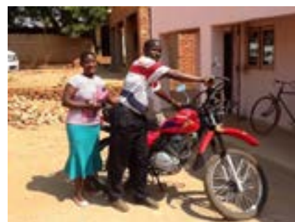
Timbiri SACCP treasurer (lady) and Secretary stand with a brand new motorbike given to the SACCO by Empower to ease mobility during member mobilisation.

Empower is working with Malawi Union of Savings and Credit Cooperatives (MUSCCO) to provide capacity building support for the SACCO. 40 community members were trained and applied for the cooperative registration with the Registrar of Cooperatives under the Ministry of Trade and Industry. The Timbiri SACCO is now a registered financial cooperative. It is expected to open its doors in November 2015 and address financial inclusion for hundreds of households in the region over the next year.