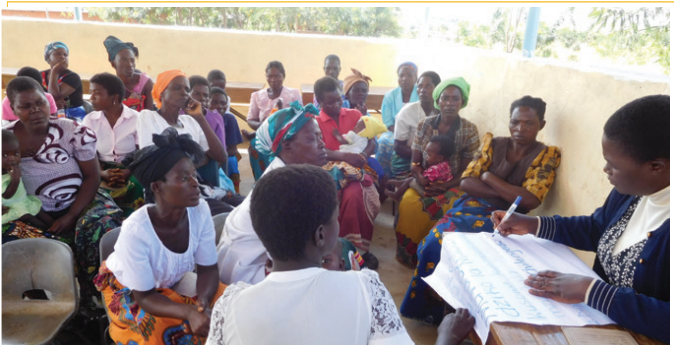
FIGURE 4: A GROUP OF 50 COMPRISING PARENTS, TEACHERS AND STUDENTS WERE TRAINED IN PERMACULTURE AT KAKOMA PRIMARY SCHOOL

A group of 50 participants, comprising of students, parents and teachers were trained in permaculture at Kakoma Primary School. This design science for sustainability, taught by our own staff, forms the foundation of our approach by helping communities understand what sustainability looks like in practice. With this knowledge they develop action plans to address some of the core issues that students contend with at school e.g. coming to class hungry, having no access to electricity or water, poor toilet facilities.