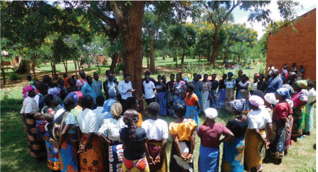
FIGURE 1: A VISION WORKSHOP IN PROGRESS IN LILONGWE DISTRICT

Our latest project in Malawi's Lilongwe district involves two sub-regions (Demera and Ngwangwa) comprising of 100 villages.