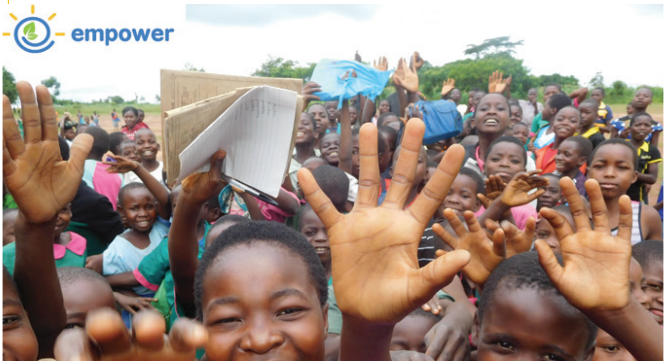
FIGURE 3: EXCITED STUDENTS GREET US AT KAKOMA PRIMARY SCHOOL

We have commenced work with two schools in the region, Kakoma Primary School (900+ students) and Kabadula Primary School (2000+) students) . Our mission is to help transform these schools into community-led sustainability hubs.