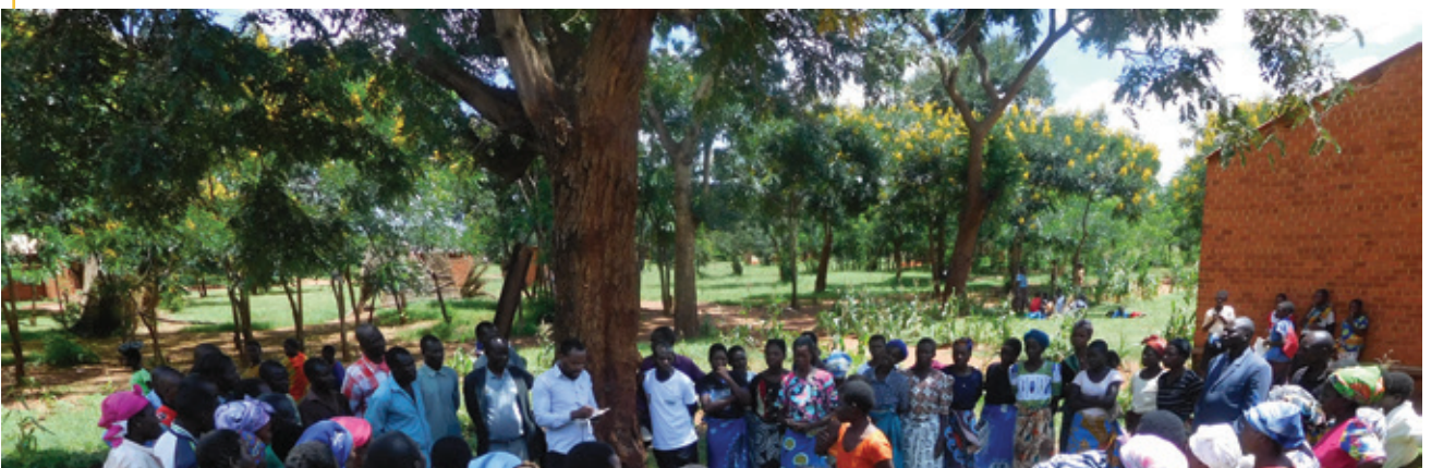
FIGURE 2: TRAINERS FROM THE MINISTRY OF TRADE TEACHING FARMERS ON HOW TO ESTABLISH AND MANAGE A COOPERATIVE.